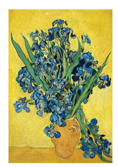
Vase with Irises Against a Yellow Background, 1890 by Vincent Van Gogh

Complementary colour relationships are used by artists to create both harmony and energy in their work.