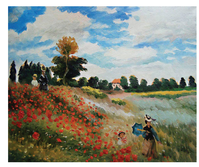
The Poppy Field near Argenteuil 1873 by Claude Monet