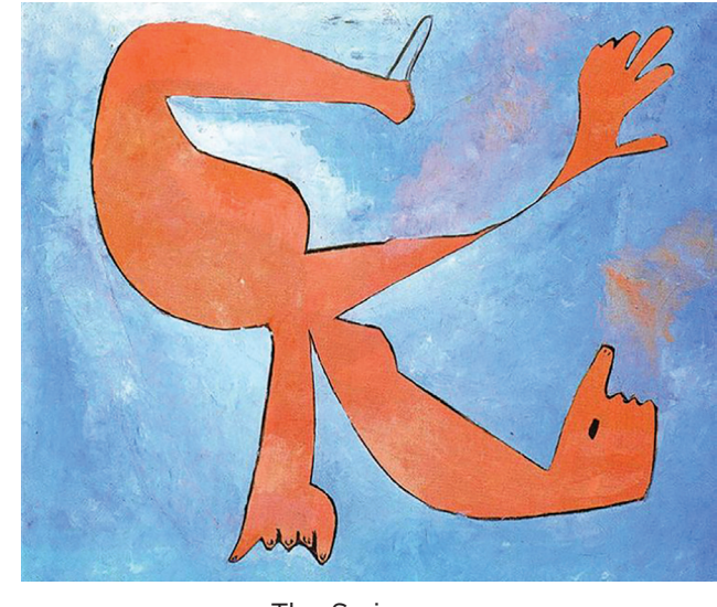
The Swimmer, 1929 by Pablo Picasso